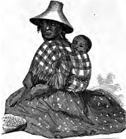
SEYLAMIAHYG AND PAPPOOSE, NORTH AMERICANS.

disappointed, for I found that they were all entitled to the promised reward. Their little hearts and eyes were filled with joy as they each repeated the Psalm. When each had received her bit, one little girl, sharper than the rest, proposed to make a collection for poor old Jem for the use of the hut. The suggestion was unanimously carried out. The poor old lady gave